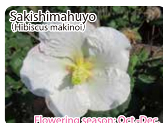
Flowering season: Oct–Dec. Place: ⑬ Row of Indian Almond Trees