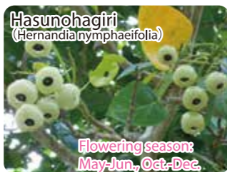
Flowering season: May–Jun., Oct–Dec. Place: ⑤ Salt/wind Tolerant Tree Zone