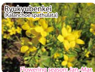
Flowering season: Jan–Mar. Place: ⑦ Ground Cover Plant Zone