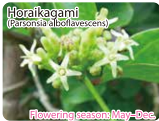
Flowering season: May–Dec. Place: ③ Forage Garden for Butterflies