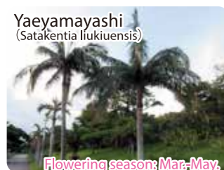
Flowering season: Mar–May. Place: ⑥ Salt/wind Tolerant Palm Tree Zone