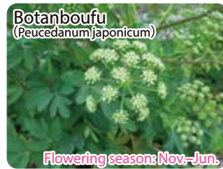
Flowering season: Nov–Jun. Place: ② Herb Garden Zone