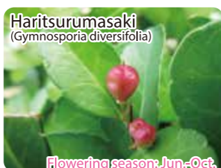
Flowering season: Jun–Oct. Place: ⑧ Salt/wind Tolerant Bush Zone ⑫ Hedge and Vine Zone