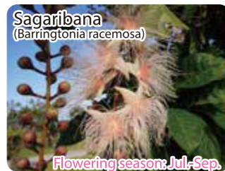
Flowering season: Jul–Sep. Place: Near ③ Forage Garden for Butterflies