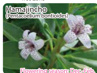
Flowering season: Dec–Feb. Place: ⑧ Salt/wind Tolerant Bush Zone