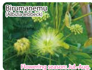
Flowering season: Jul–Aug. Place: ⑤ Salt/wind Tolerant Tree Zone