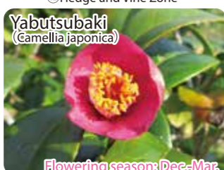
Flowering season: Dec–Mar. Place: ⑭ Acid-loving Plant Zone