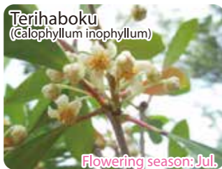
Flowering season: Jul. Place: ④ Street Tree Zone