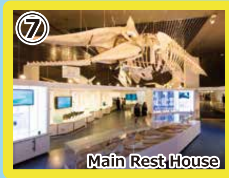
7 Main Rest House