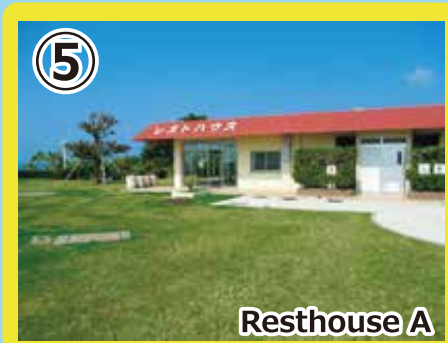
5 Resthouse A