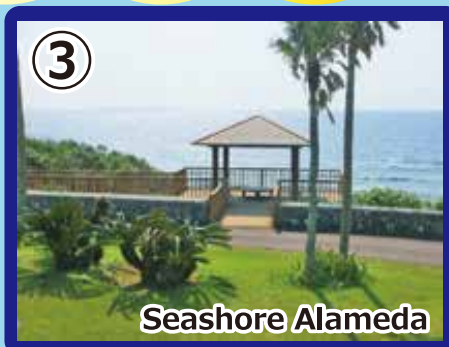
3 Seashore Alameda