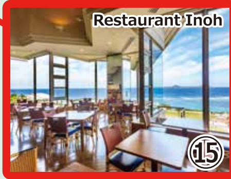
15 Restaurant Inoh