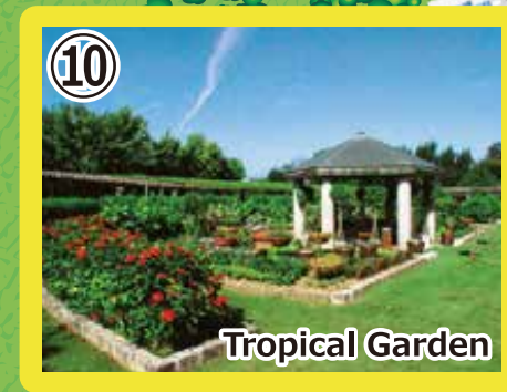
10 Tropical Garden