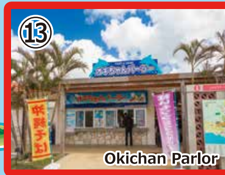
13 Okichan Parlor