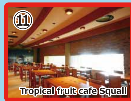
11 Tropical fruit cafe Squall