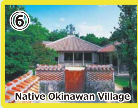
6 Native Okinawan Village