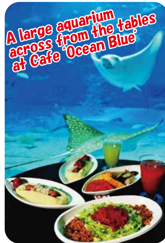
▲【Cafe "Ocean Blue"】 ⑪

From Okinawa classics like Okinawa soba and taco rice to original sweets, you can enjoy light meals and dishes inside the park for your needs.