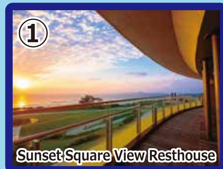
1 Sunset Square View Resthouse