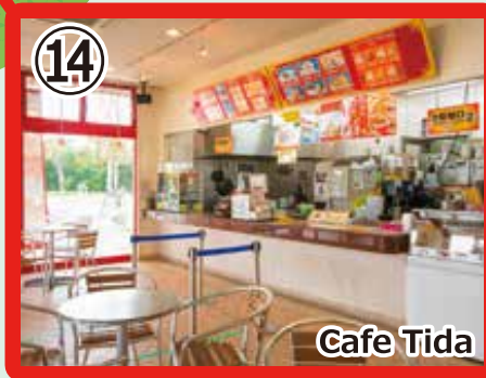
14 Cafe Tida