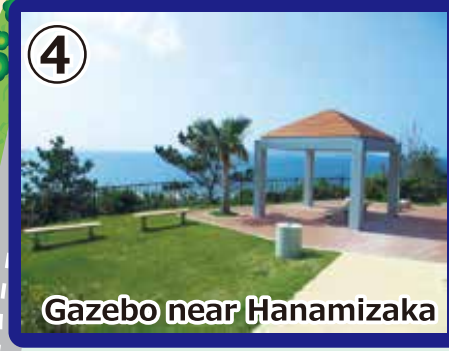
4 Gazebo near Hanamizaka