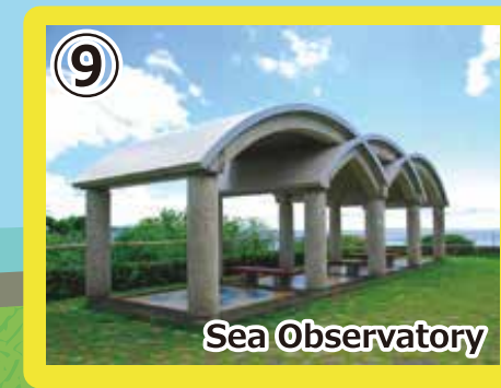
9 Sea Observatory