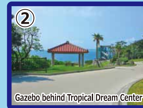
2 Gazebo behind Tropical Dream Center