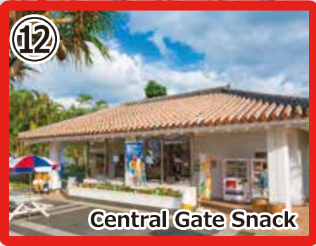
12 Central Gate Snack