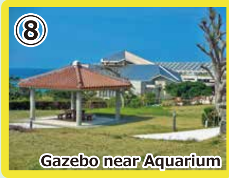
8 Gazebo near Aquarium