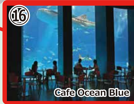
16 Cafe Ocean Blue