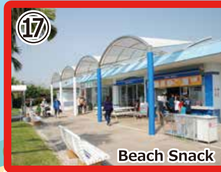
17 Beach Snack