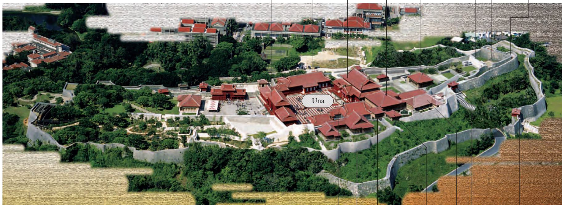
※Completed image diagram, there is a possibility it will change.

※ Indicates areas not open to the public.