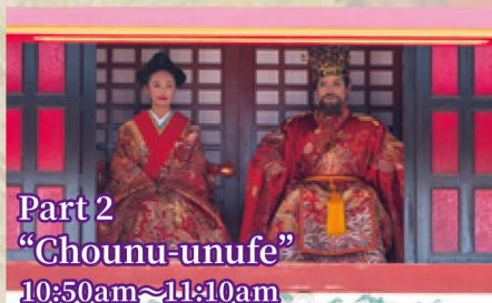
Part 2 "Chounu-unufe" 10:50am~11:10am

The whole kingdom including the king and representatives of officials and common people celebrate the New Year. It is a ceremony to pray for peace and calmness.