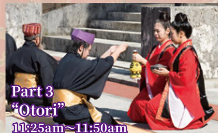
Part 3 "Otori" 11:25am~11:50am

It is a ceremony for the retainers to pledge allegiance to the king as well as celebrate the king's long life and pray for the prosperity of the kingdom.