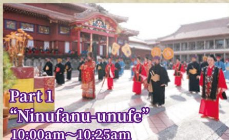
Part 1 "Ninufanu-unufe" 10:00am~10:25am

The whole kingdom including the king and representatives of officials and common people celebrate the New Year. It is a ceremony to pray for peace and calmness.